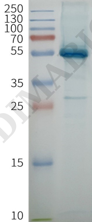
Figure 2. Human MBP-CLDN6-Nanodisc with N-MBP Tag, C-Flag Tag on SDS-PAGE