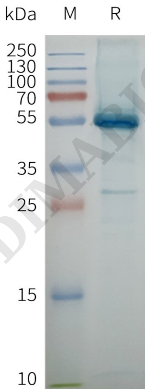
Figure 2. Human MBP-CLDN6-Nanodisc with N-MBP Tag, C-Flag Tag on SDS-PAGE