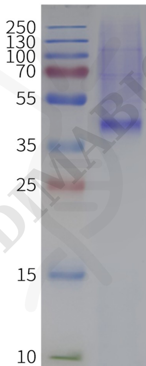
Figure 2. Human MC4R-Strep-Nanodisc, C-Flag&Strep Tag on SDS-PAGE