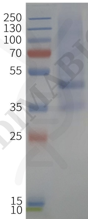
Figure 2. Human MTR1B-Strep-Nanodisc, C-Flag&Strep Tag on SDS-PAGE