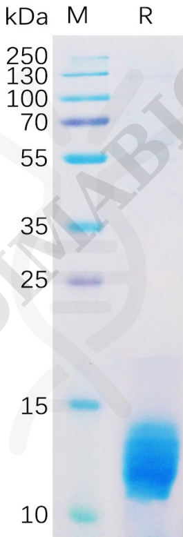
Figure 1. Human MUC1 Protein, His Tag on SDS-PAGE under reducing condition.