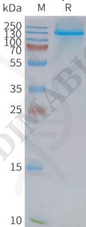
Figure2. Human NPC1L1-Nanodisc, Flag Tag on SDS-PAGE