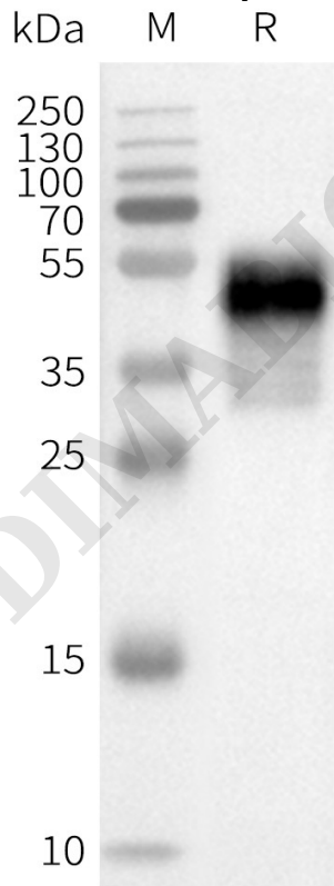
Figure 2. WB analysis of Human NPY1R-Nanodisc with anti-Flag monoclonal antibody at 1/5000 dilution, followed by Goat Anti-Rabbit IgG HRP at 1/5000 dilution