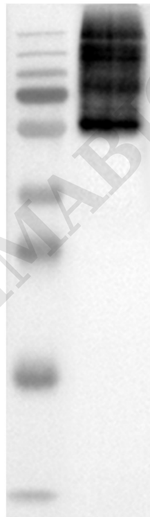
Figure 2. WB analysis of Human OPRM-Nanodisc with anti-Flag monoclonal antibody at 1/5000 dilution, followed by Goat Anti-Rabbit IgG HRP at 1/5000 dilution