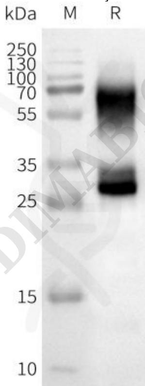
Figure2. WB analysis of Human OR2B3-Nanodisc with anti-Flag monoclonal antibody at 1/5000 dilution, followed by Goat Anti-Rabbit IgG HRP at 1/5000 dilution