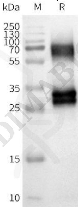
Figure2. WB analysis of Human OR8U8-Nanodisc with anti-Flag monoclonal antibody at 1/5000 dilution, followed by Goat Anti-Rabbit IgG HRP at 1/5000 dilution