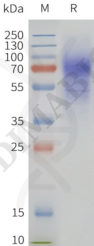
Figure 2. Human HCRT2-Strep-Nanodisc, C-Flag&Strep Tag on SDS-PAGE