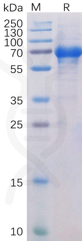
Figure 1. Human OX40 Protein, hFc-His Tag on SDS-PAGE under reducing condition.