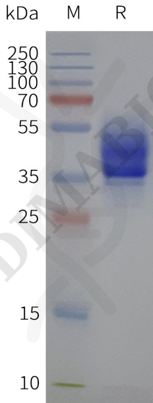
Figure 2. Human S1PR2-Strep-Nanodisc, C-Flag&Strep Tag on SDS-PAGE