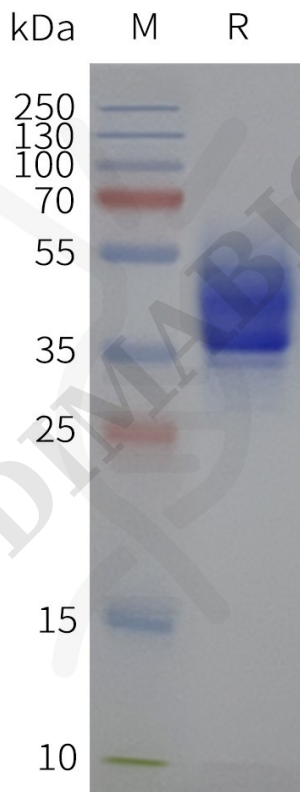
Figure 2. Human S1PR2-Strep-Nanodisc, C-Flag&Strep Tag on SDS-PAGE