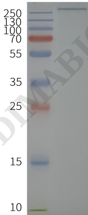
Figure 2. Human SCN5A-Nanodisc, Flag Tag on SDS-PAGE