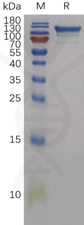
Figure 1. Human SEMA4D Protein, His Tag on SDS-PAGE under reducing condition.