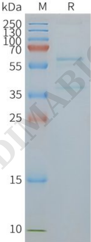
Figure2. Human SLC2A4-Nanodisc, Flag Tag on SDS-PAGE