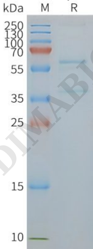
Figure2. Human SLC2A4-Nanodisc, Flag Tag on SDS-PAGE