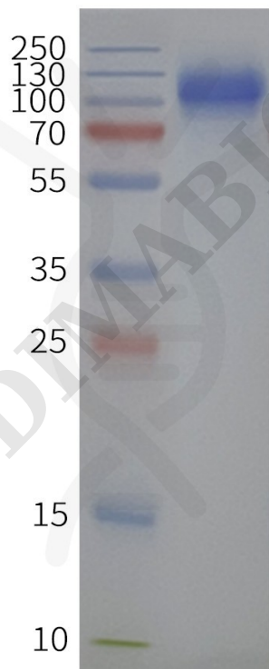
Figure 2. Human SLC34A2-Strep-Nanodisc, C-Flag&Strep Tag on SDS-PAGE