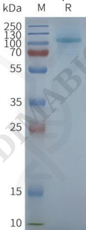
Figure2. Human TAS1R3-Nanodisc, Flag Tag on SDS-PAGE