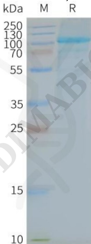
Figure2. Human TLR5-Nanodisc, Flag Tag on SDS-PAGE