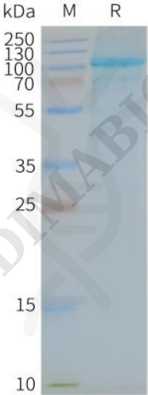
Figure2. Human TLR5-Nanodisc, Flag Tag on SDS-PAGE