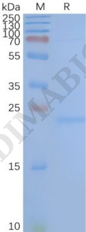
Figure2. Human TM4SF1-Nanodisc, Flag Tag on SDS-PAGE