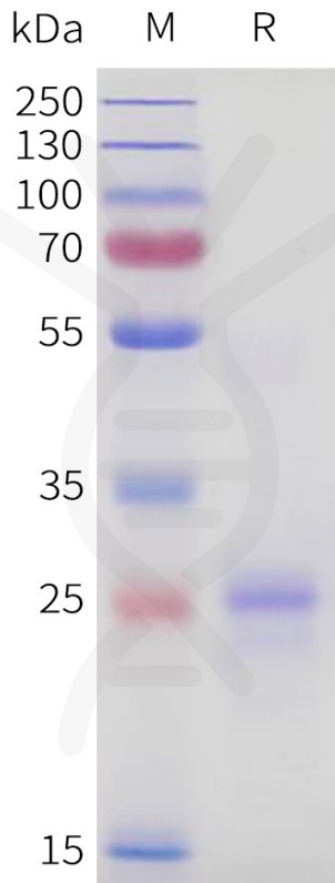
Figure 1. Human TNFSF15 Protein, N-His Tag on SDS-PAGE under reducing condition.