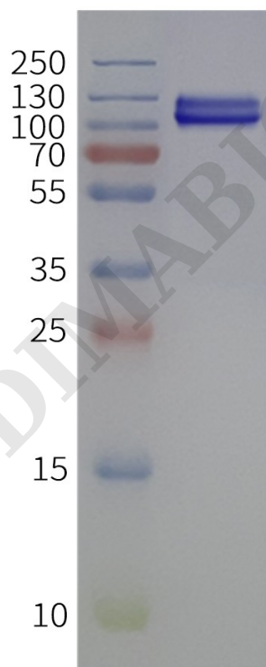
Figure 2. Human TSHR-Strep-Nanodisc, C-Flag&Strep Tag on SDS-PAGE