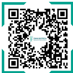
CAR-T Lead Molecules Discovery Platform Website