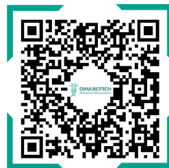
DiLibrary™ Mammalian Display Platform Website