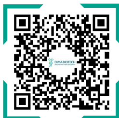
The Solution of ADC Development Website