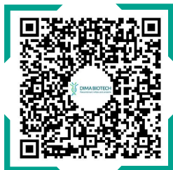
Full-length Transmembrane Protein Website