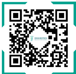
Nanodiscs Membrane Protein Website