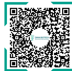
Mammalian Cell Display Technology Blog