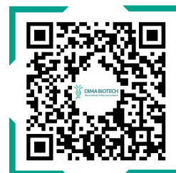
ADC Reagent Video