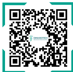
ADC Reagents Website